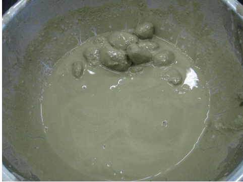
<TG Parikku III Used Independently>

Example of Use on Clod with a High N Value