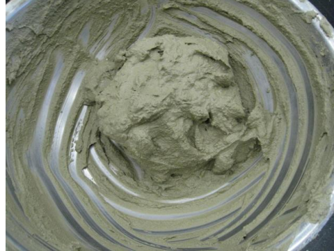
<TG Parikku III + TG Gel Used Together>

Capable of dispersing clod with a low injection rate